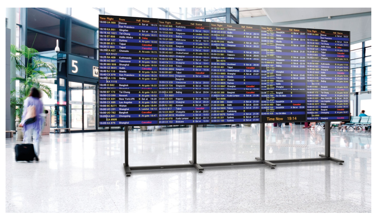
Vogel's Connect-it Floor Series

By joining forces, both companies can improve their market position and realise new developments in the professional market for mounting systems. The two companies are complementary to each other and will strengthen each other through this acquisition.